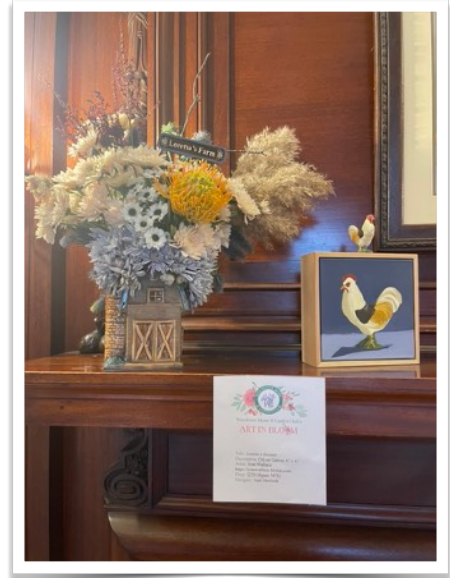
Artwork: Jean Wallace

https://www.signupgenius.com/go/5080E45A4A623A46-48992853-april