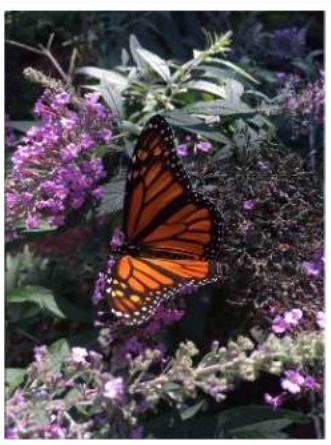
Monarch Butterfly in Fleur Hynes' Garden