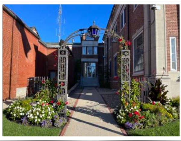
WHGC Site at the Police Station Entrance