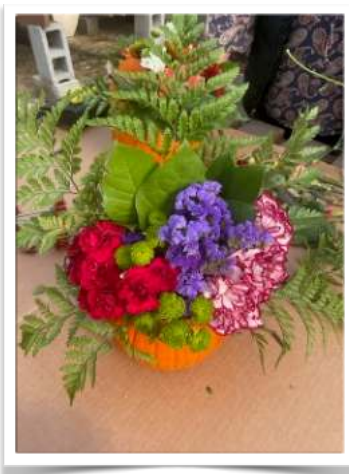
McCue's Sugar Pumpkin Decorating Workshop (see website for more photos!)