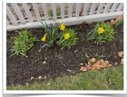
Signs of Spring & Indoor Flora from Our Members

We will plant the bed with new material in early May. A separate email will be sent closer to that date.