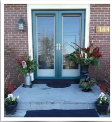
Cheryl Curtin's new front doors